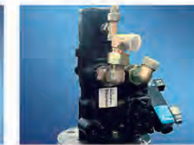
振动泵 VIBRATORY PUMP