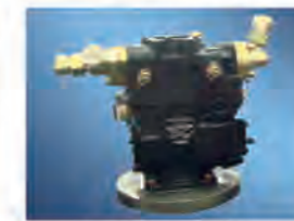
驱动泵 DRIVE PUMP