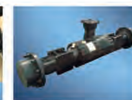
驱动桥 DRIVE AXLE